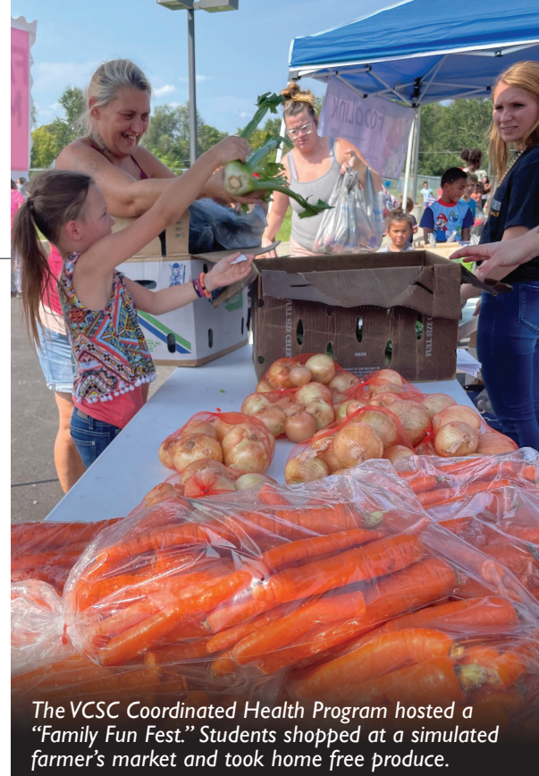
The VCSC Coordinated Health Program hosted a "Family Fun Fest." Students shopped at a simulated farmer's market and took home free produce.

The Coordinated Health Program has also offered eating disorder education in high schools and lessons about sugar in middle schools. Additionally, navigators continue to expand programming by partnering with multiple community organizations, including Purdue Extension's Nutrition Education Program, Catholic Charities, Terre Haute Fire Department, Indiana State University, and Union Health.